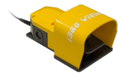
Foot pedal input